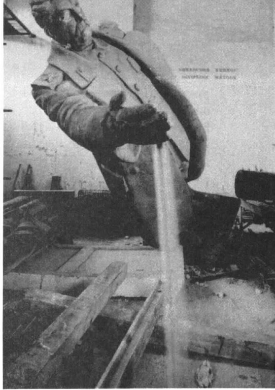
Statue of Stalin in storage in Tiranë

reestablishing diplomatic relations between the two countries. United States secretary of state James Baker visited Albania in June 1991, following the CSCE meeting in Berlin at which Albania was granted CSCE membership. During his visit, Baker informed the Albanian government that the United States was prepared to provide Albania with approximately US$6 million worth of assistance. He announced that the United States welcomed the democratic changes that were taking place in Albania and promised that if Albania took concrete steps toward political and free-market reforms, the United States would be prepared to offer further assistance.