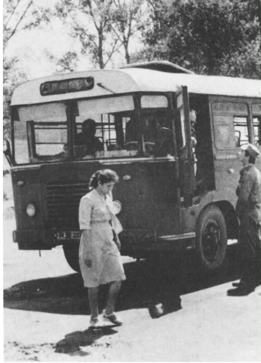
Bus driver talking to soldier at the terminus near the port city of Durrës

People's Army attended the East-West Seminar on Military Doctrines in Vienna for the first time in 1991.