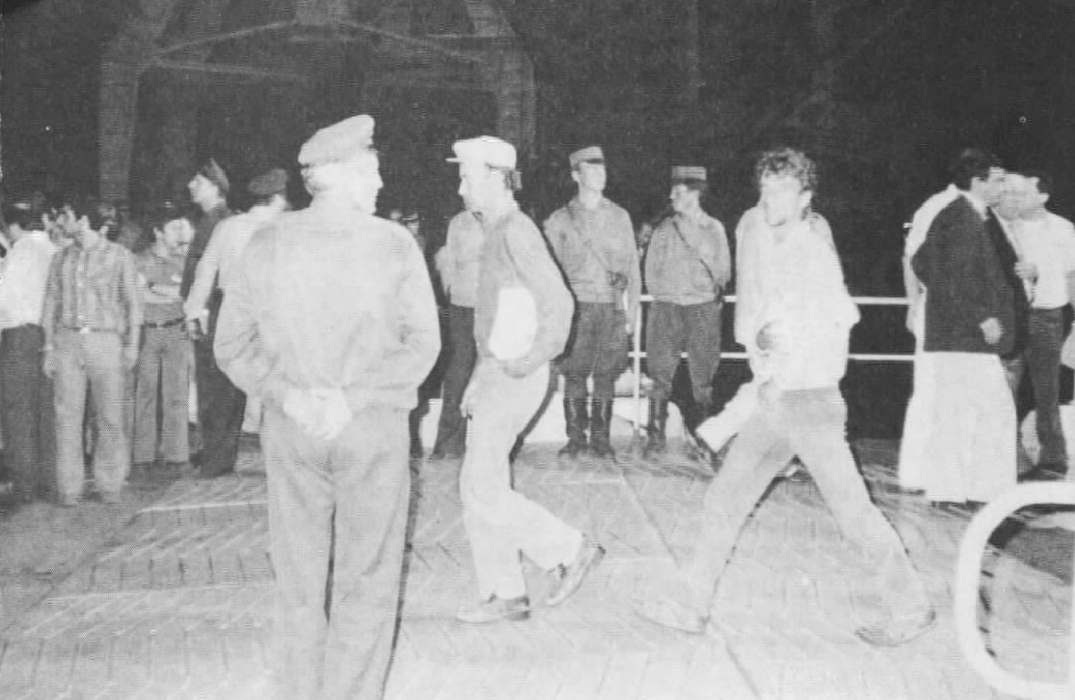
The forced return of Albanian refuge-seekers from Italy at the port of Durrës, June 1991

exodus that the NIS was unable to stem. The refugee problem reached epidemic proportions in August 1991, with 15,000 Albanians seeking asylum in Italy; most were later returned to Albania.