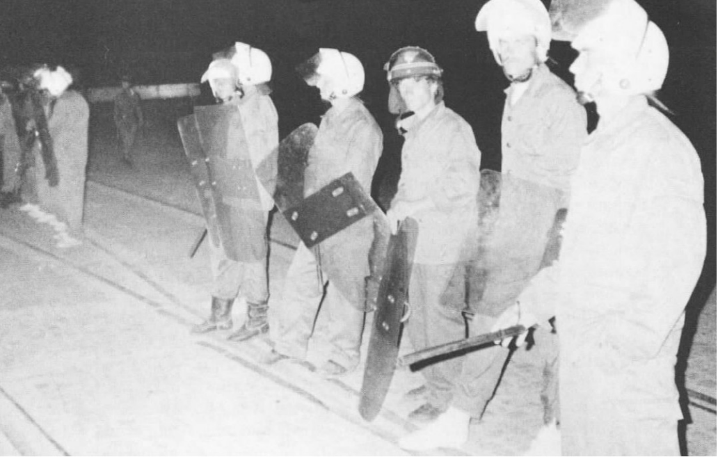
Albanian riot police maintaining order as refuge-seekers return from Italy

was viewed so seriously that some citizens believed that social anarchy was overwhelming the state's ability to handle it. The end of the party's monopoly on political power and the curbing of the coercive power of the state's law enforcement mechanism gave many common criminals courage to act. The minister of public order cited a general breakdown in law enforcement and public safety in Albania in 1991. He reported that many crimes were being committed by unemployed individuals, common criminals inadvertently released from prison under political amnesties, and citizens taking revenge on officials of the former communist regime. He blamed many problems of the police on their former cooperation with the Sigurimi in its role of protecting the party and state against the citizens. According to the minister, the police would be depoliticized, and patriotic, legal, and professional training would replace members' former political indoctrination.