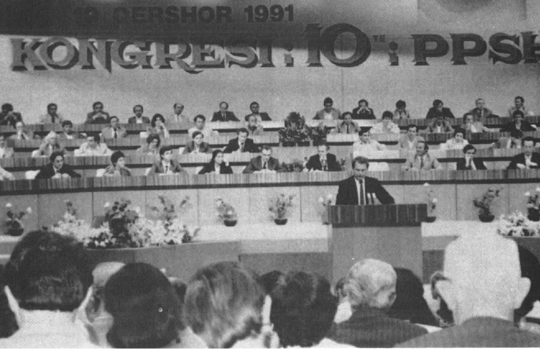
Speaker at the Tenth Party Congress of the Albanian Party of Labor, June 1991

that were vulnerable to graft and corruption would be rotated on a regular basis.